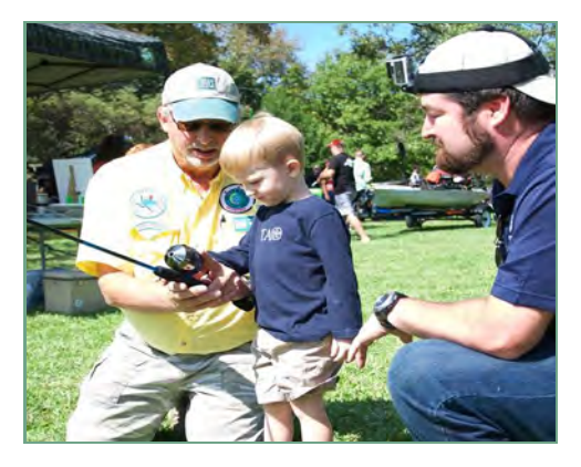
exhibit focusing on Expedition/Overland vehicles and participants. Overlanding is essentially vehicle based camping that covers longer distances than traditional car camping. Very exciting! There will be prize drawing and food available for purchase. Bring your family and enjoy a great free outdoor event in your own neighborhood! See you there and remember -#LiveLifeOutside. Check us out on facebook, twitter, Instagram and on our website, <u>http://</u> www.texasavidoutdoors.com.

Outdoors as a way to share our love of the outdoors with others. We are all family men and with children of our own and we feel it is important to give our kids that experience. Two years ago, we came up with the idea to host an event to help get families excited about getting outside and the Fall Outdoor Expo was born. Over the past two years, we have seen great growth and participation and we are extremely excited about this year! We are in the process of finalizing all of our participants for this year and we are adding a new and exciting segment. We will be partnering with Texas Overland to feature an